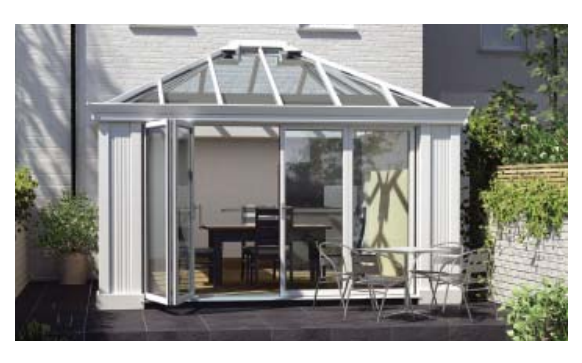
... and NOW instead of brick columns consider the new super insulated Loggia columns.